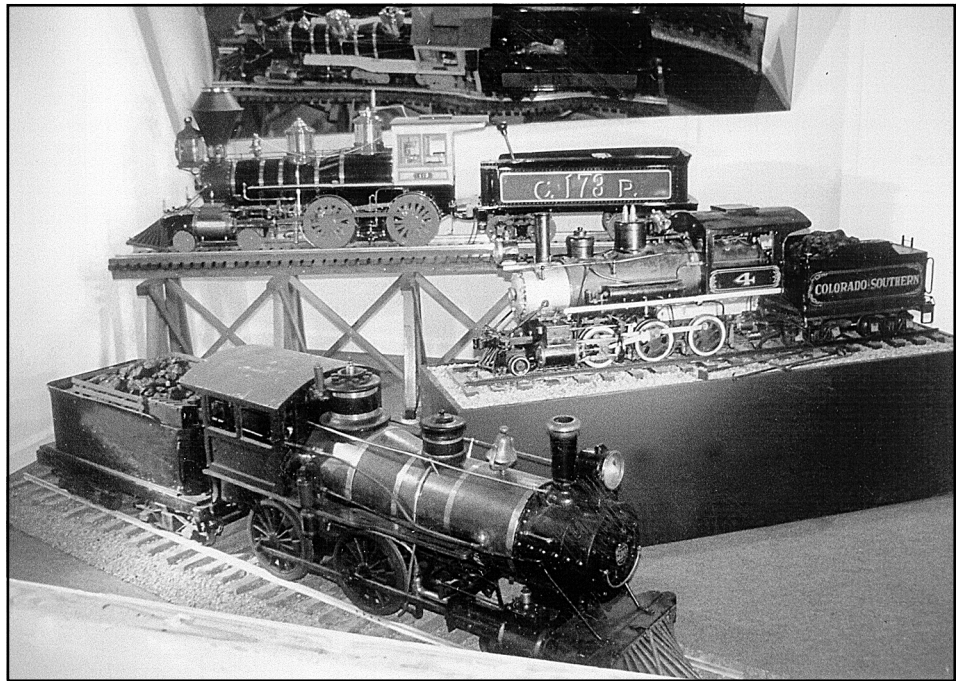
The new display of live steam engines at the Colorado Railroad Museum. From front, Number 210, Number 4 and Number 173 prior to the addition of the interpretive signs.

The prototype for this 2-6-0 passenger locomotive was built by Cooke Locomotive works of Paterson, New Jersey, in 1884 as Denver, South Park and Pacific No. 39. It was renumbered 109 in 1885 and then Denver Leadville and Gunnison No. 109 in 1889. It was rebuilt and became Colorado and Southern No. 4 in 1900. A photo taken as it operated in 1927 showed it with a "bear trap" cinder catcher.