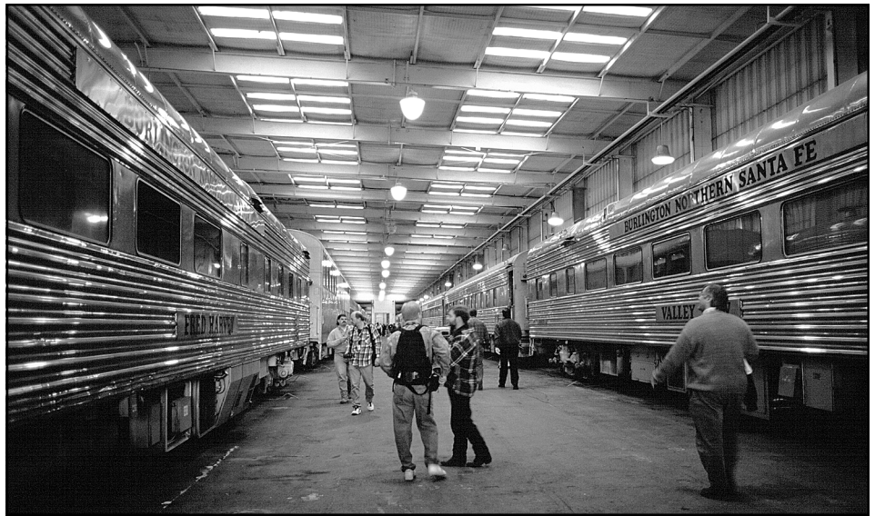
BNSF showed off its Topeka, KS, shops to the RPCA on January 13, 2002. The BNSF stores their passenger car fleet inside. At left was FRED HARVEY, ex-Atchison, Topeka and Santa Fe diner, ex-ATSF 61. On the right is VALLEY VIEW. — Photo © Daren Genau.

A Union Pacific coal train derailed at 6:10 PM Monday, 2/12/02, causing a backup of trains that stretched from Brady to Lexington, NE. Two hundred Union Pacific Employees and contractors are cleaning up the mess a derailed coal train left on the western edge of Lexington. A