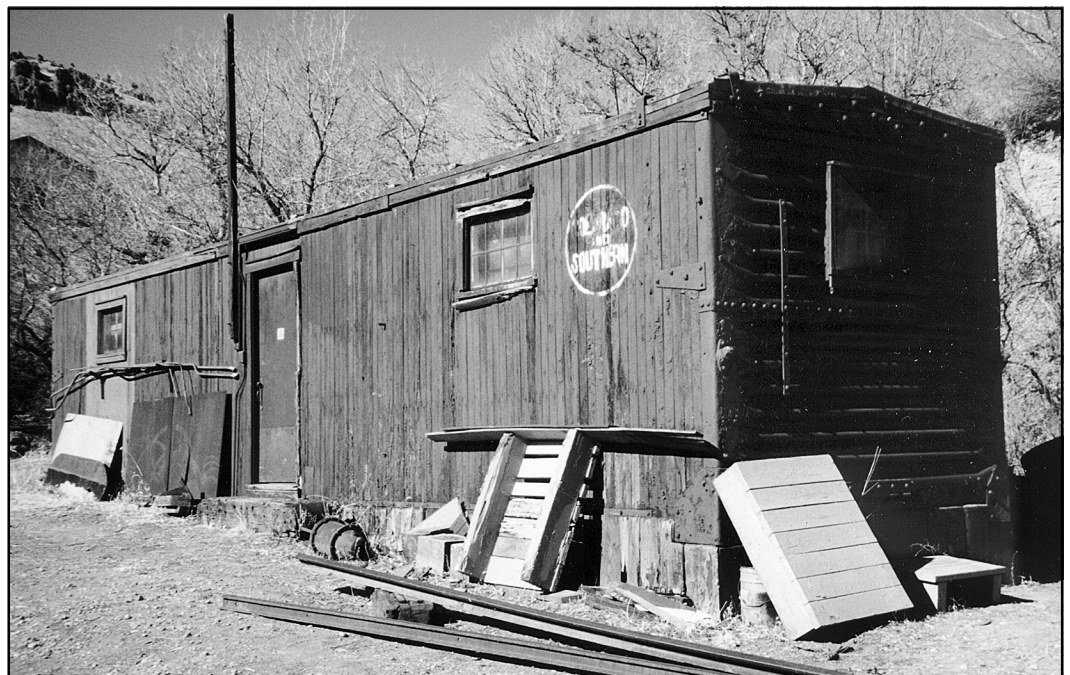
The Club's C&S "Club" car, originally a C&S standard gauge boxcar. The car was donated to the Club by the C&S Railroad in 1969. We would like information on the history of the car.