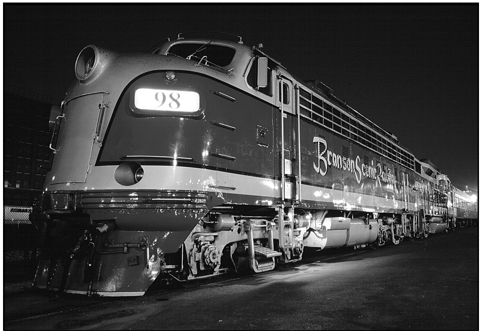
The Railroad Passenger Car Alliance (RPCA) operated a 7-car train from Kansas City, MO, to Topeka, KS. After the journey, Branson Scenic Railroad F-9PH #98 was at Kansas City Union Station on January 13, 2002.